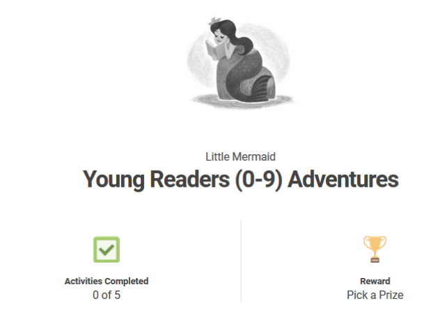
These activities are for Young Readers aged 0-9. To earn this badge and a prize, complete 5 activities.

Below is an example of an Activity Badge and instructions. Below the instructions you will find a list of activities to complete.